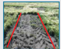
Olympus + Roundup followed by Varro